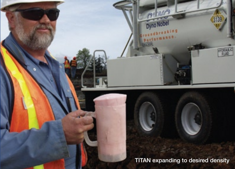
TITAN expanding to desired density