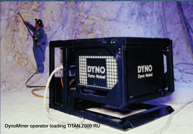
DynoMiner operator loading TITAN 7000 RU