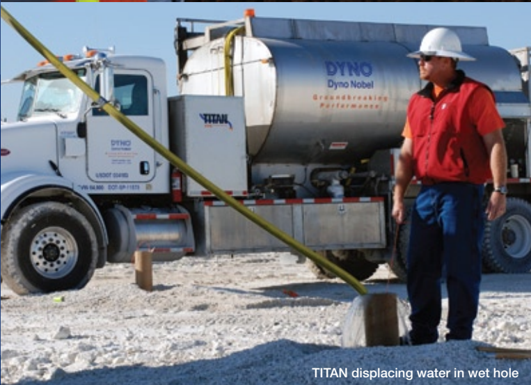
TITAN displacing water in wet hole