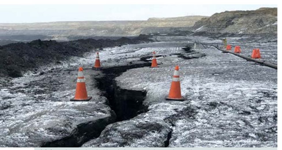
A 2-ft crack opened and widened along the coal seam dewatering structure at a mine in Wyoming. It prompted a special blasting project managed by a Blast Optimization Team, which used TITAN products to accomplish their goals.

The TITAN Differential Energy calculator was used to arrive at the blast-