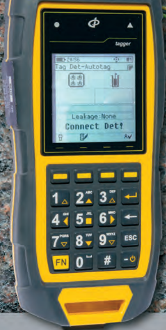
Rugged DriftShot Tagger